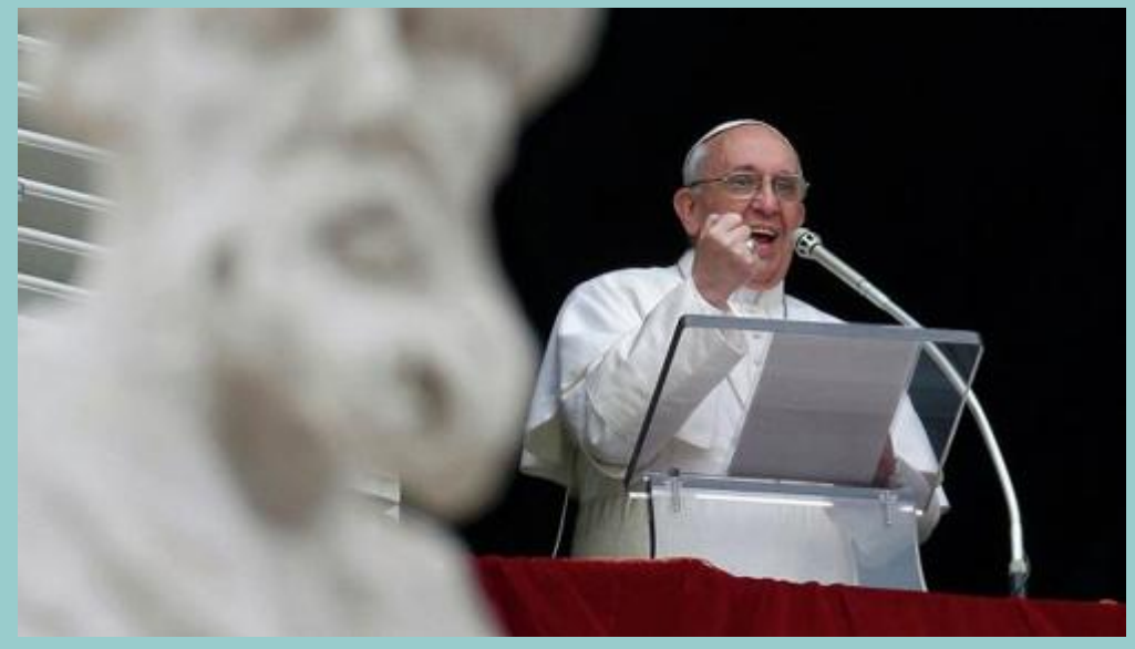
Pope Francis I

The good news that we now wish to share with you is that we are at last living during the reign of the 8<sup>th</sup>"king" and that we are only few years away from the glorious Second Coming of Yahushua, and eternity. However, between now and the Second Coming, we have to pass through the mother of all persecutions and trials. There is much work to be done in our hearts and characters, and much work to be done warning the world of what is about to transpire. Are we ready for life under the reign of 8<sup>th</sup> "king," the last pope of Rome? We pray that we all will become ready before our personal probation is forever closed.