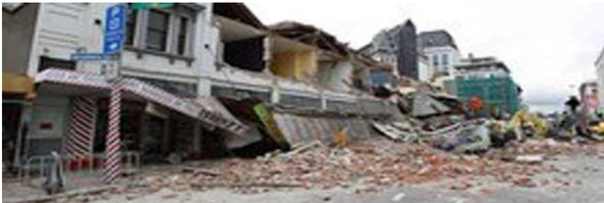
Christchurch Earthquake | Christchurch Hit By 6.3 Earthquake

Christchurch earthquake: 'Dead bodies lying around' click photo>>>